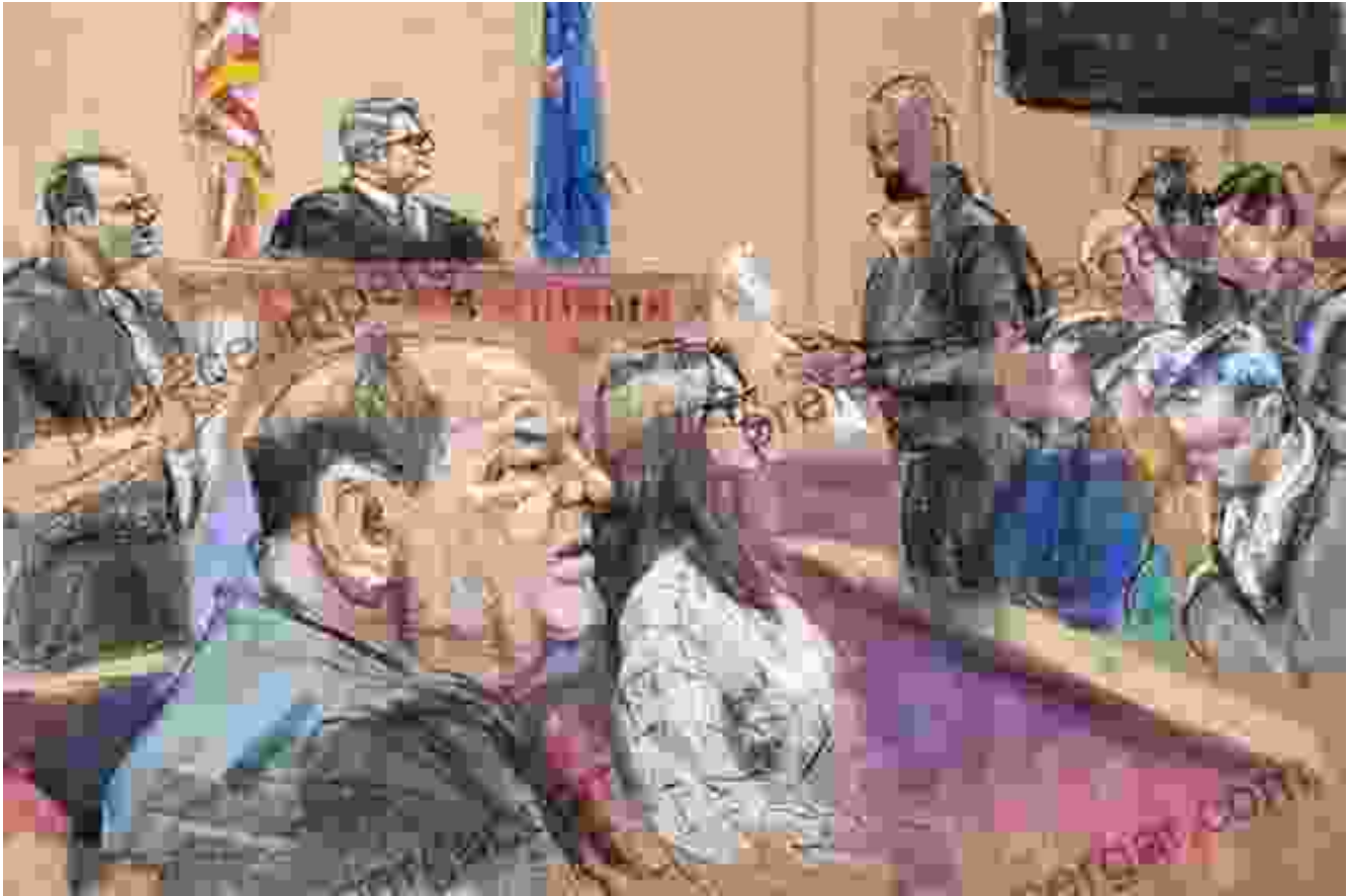
A courtroom sketch of the trial.

denials, and chilling revelations. Witnesses take the stand, their testimonies painting a disturbing picture of a community torn apart by fear and suspicion.