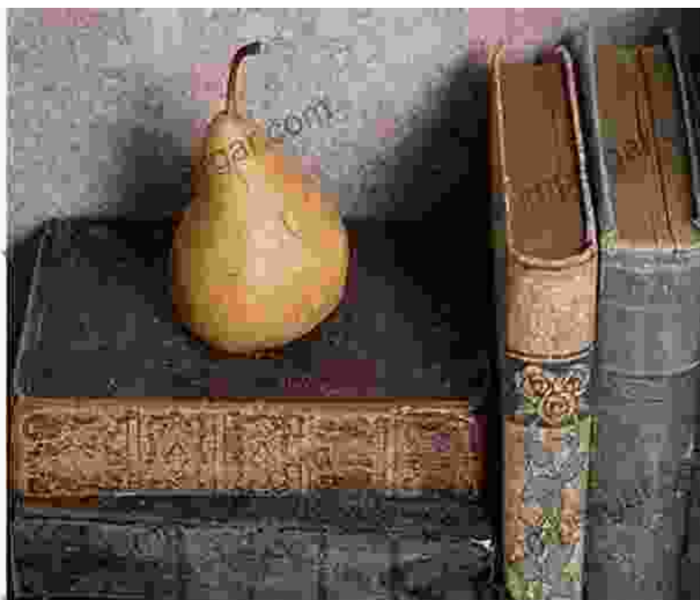
JOURNAL AND CORRESPONDENCE OF MISS ADAMS, DAUGHTER OF JOHN ADAMS, SECOND PRESIDENT OF THE UNITED STATES. WRITTEN IN FRANCE AND ENGLAND, IN 1785

With each turn of the page, we become privy to Miss Adams's innermost thoughts and feelings as she grapples with issues of love, friendship, and her own identity. Her candid confessions and insightful observations provide a fascinating glimpse into the lives of women during this transformative period in history.