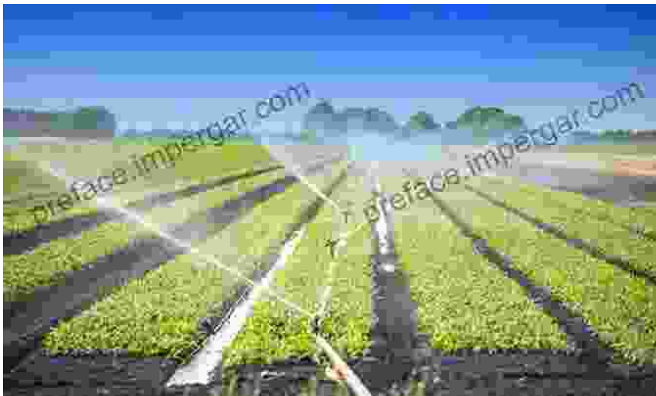
Fig. 2: Efficient Irrigation for Cassava

Understand the intricacies of water management for successful cassava cultivation. Explore irrigation techniques, drainage systems, and drought tolerance strategies. Optimize water usage to maximize crop yields while conserving this precious resource.